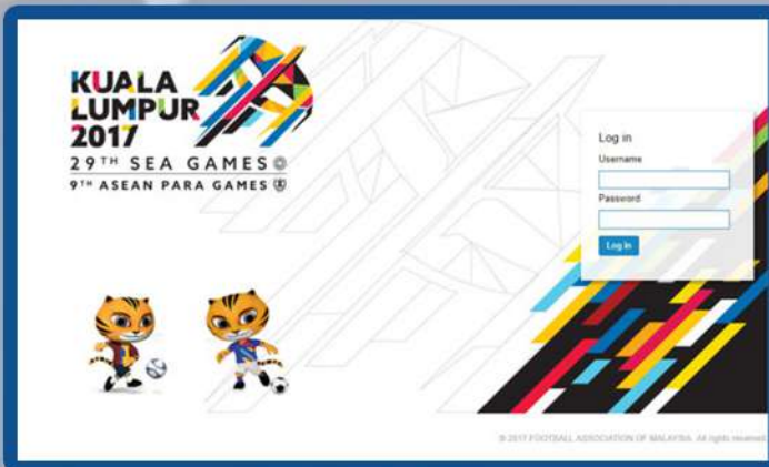
Sea Games Kuala Lumpur 2017 Football and Futsal - WSL MSC Sdn Bhd