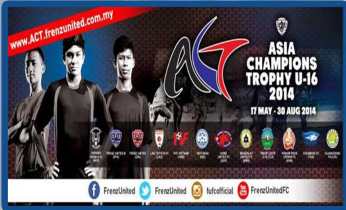
Asia Championship Trophy U-16 2014 - Frenz United